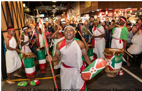
City of Adelaide Reconciliation Committee Meeting - Minutes - 24 February 2021